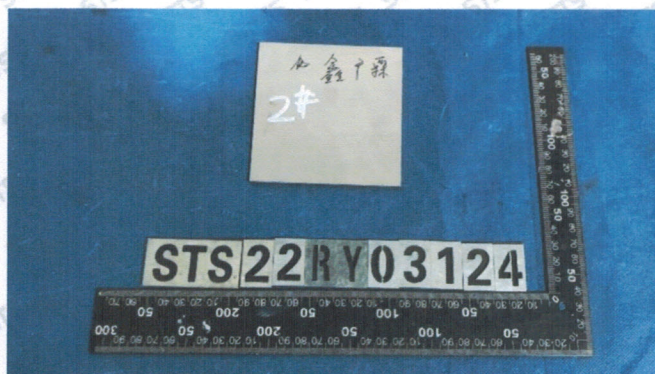
图 2/ Fig.2