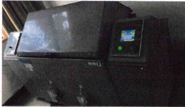
试验中/During the test